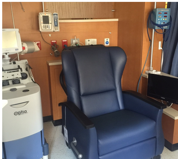
Patient treatment area

You may bring videotapes, writing or reading materials, or small crafts to do during your procedure.