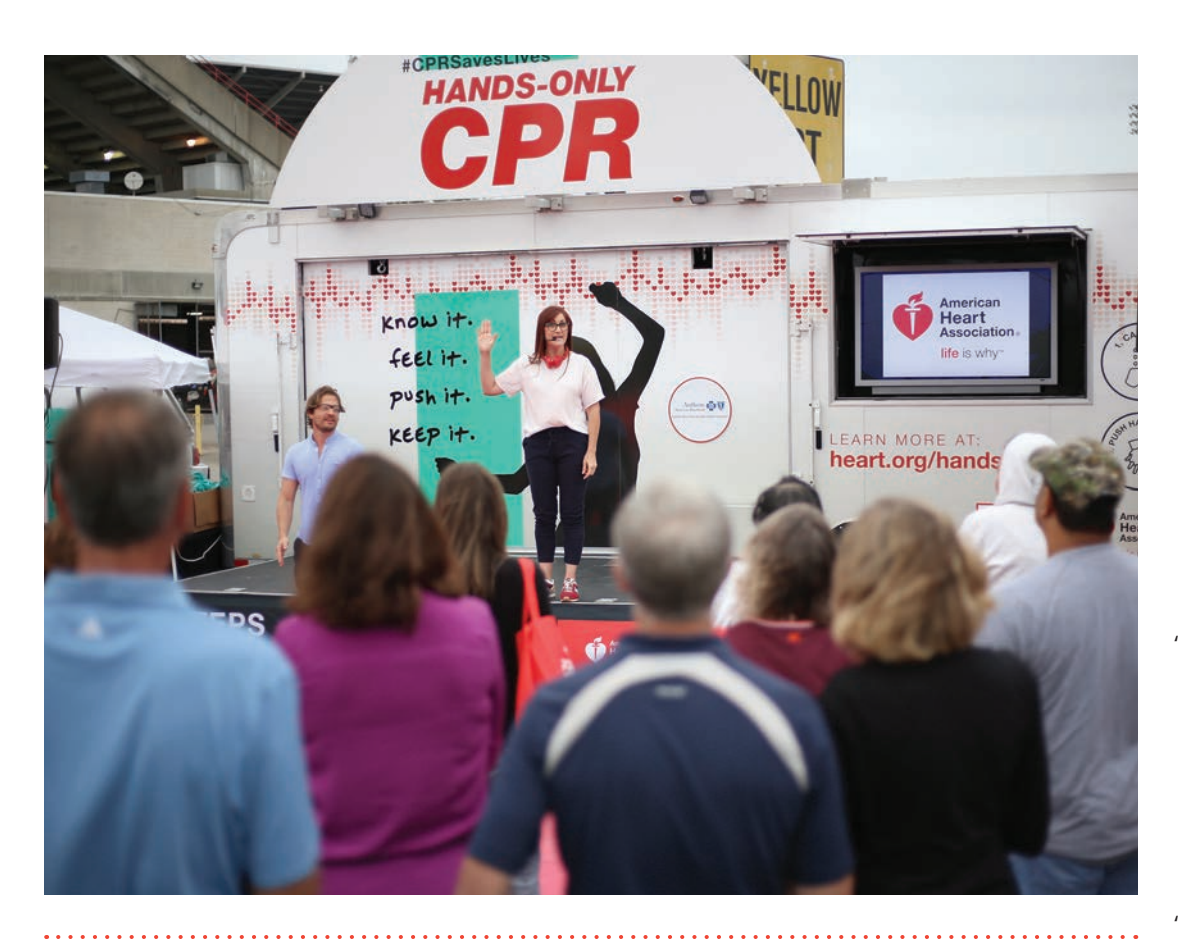
PARTICIPANTS RECEIVE INSTRUCTIONS AT THE "HANDS-ONLY CPR" MOBILE VAN.